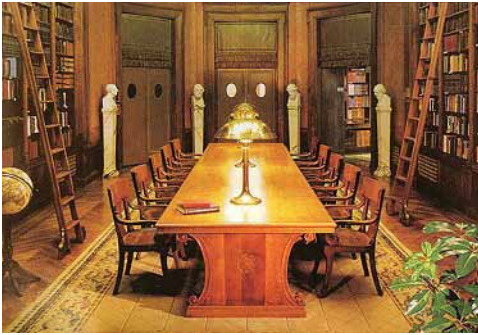
Library of the Supreme Council, 33° at the House of the Temple, Washington, D.C.

THE PROGRESSIVE TEACHINGS OF THE SCOTTISH RITE MAKE IT THE "UNIVERSITY OF FREEMASONRY"